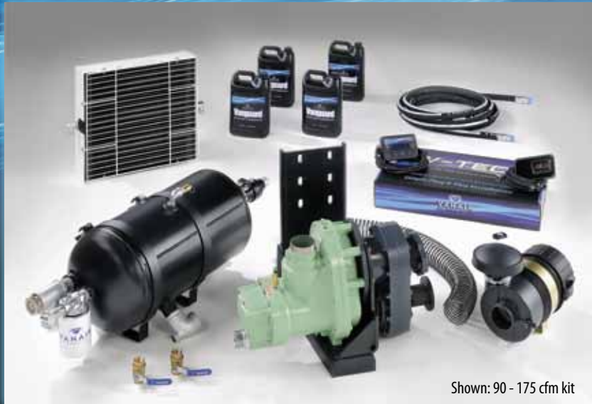
Shown: 90 - 175 cfm kit