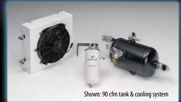
Shown: 90 cfm tank & cooling system