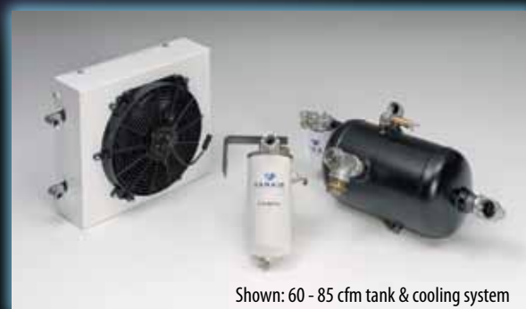
Shown: 60 - 85 cfm tank & cooling system