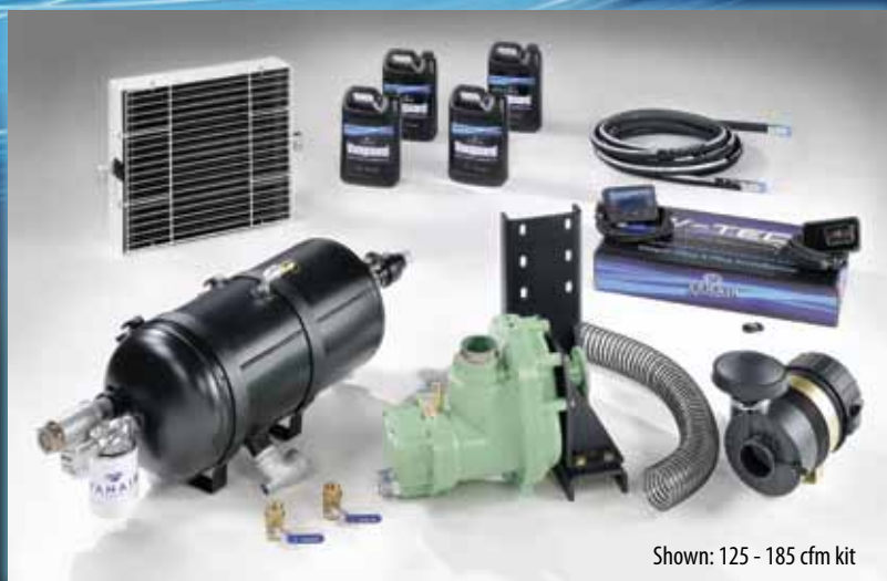
Shown: 125 - 185 cfm kit