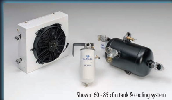
Shown: 60 - 85 cfm tank & cooling system