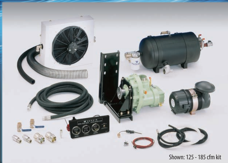
Shown: 125 - 185 cfm kit